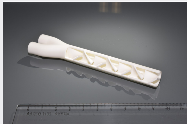
Figure 1: Static mixer (demo) produced using CeraFab 8500 in LithaLox 350D. Job preparation (above) and printed and sintered part (below). By optimizing the process settings, the production output was increased by a factor of 24 and the technical requirements were maintained.