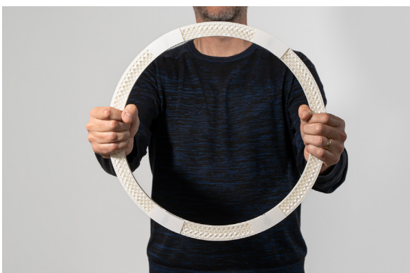
ALD ring with Ø 380 mm / 15"

The ring's significantly extended lifespan demonstrates how Lithoz LCM technology cuts down on production and warehouse cost. Up to 100 CeraFab System printers can be synchronized, independent of their location, qualifying this rapidly scalable technology as a valuable factor in the reshoring of semiconductor production.